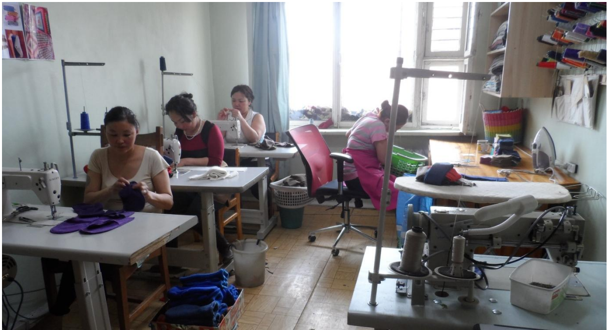
Turning old cashmere jumpers into something new