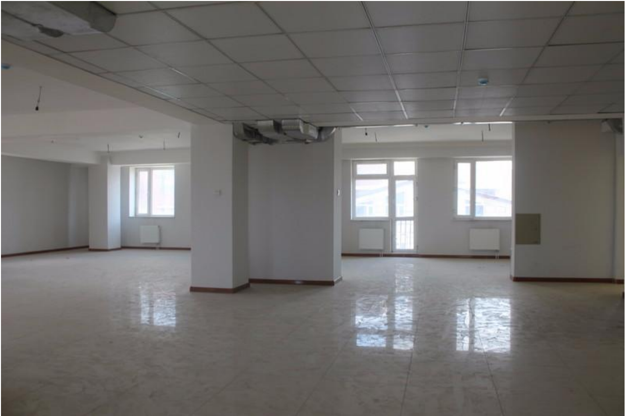
The new building that Streams in the Desert would like to use for their shelter, child day care and workshop

When we visited Streams in the Desert in May 2016, it was apparent that the current facilities are inadequate for their needs and provide no room for growth. They have been raising funds for several years and have identified premises that would be ideal for the shelter, child day care and workshop. Empower has just contributed $20,000.00 towards this project and we will be making further contributions as funds become available, to help make this dream of appropriate premises a reality. We invite you, as “friends of Empower”, to be part of the answer.