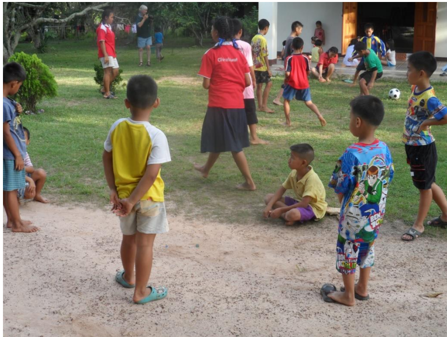
Children playing at Clear Skies House

Your contributions to the Clear Skies House project would be much appreciated. The most pressing need is to raise $26,000.00 by Christmas to enable construction of the sick bay/medical room, kitchen and office. If more funds are received than needed we will expand the work at Clear Skies House. If you have any questions regarding the process of making your donation, please contact Geoff via telephone on 0408348359 or via email at geoff@empower.org.au