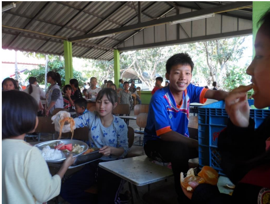
Children at Clear Skies House enjoying mealtime together

This is a much needed addition for Clear Skies House and the provision of a sick bay is a requirement of the Thai government authorities. The estimated cost of construction is $26,000.00. We are seeking to raise this amount by Christmas, so the building works can be completed in early 2018.