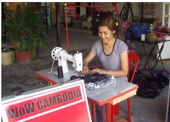
Ladies from WOW Cambodia photographed outside the Market Stall they rent (right) One of the ladies sewing (above)